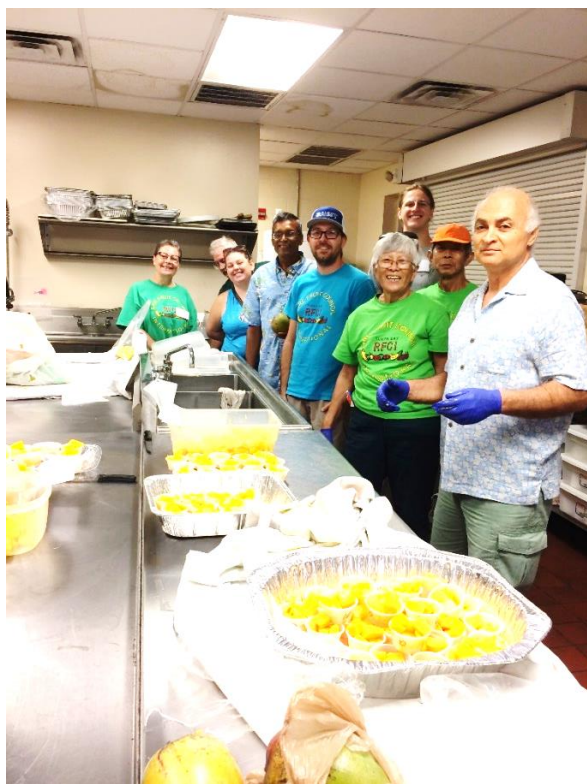
Prepping the fruit