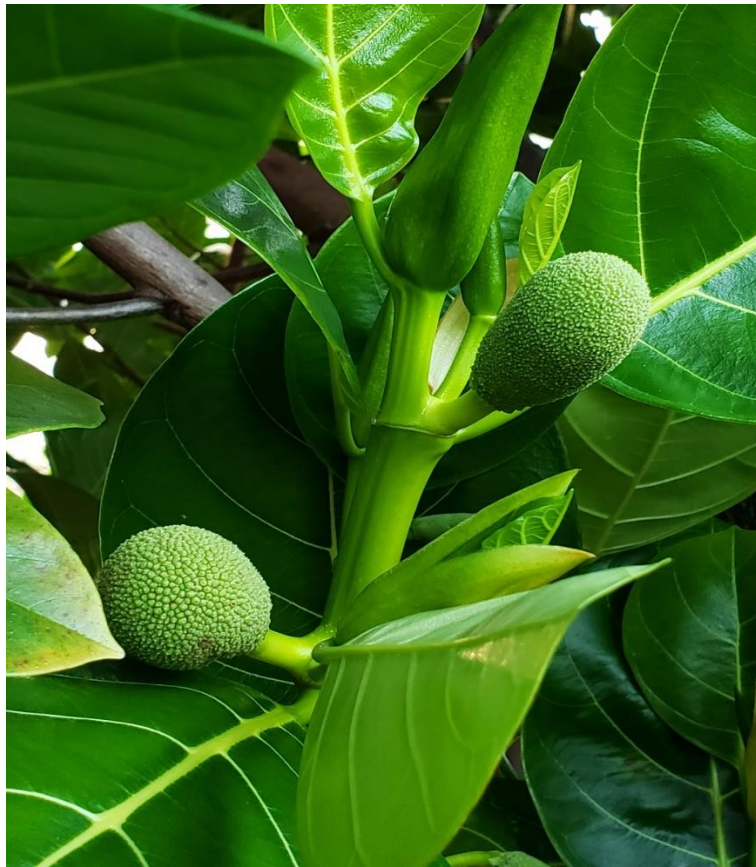
Early stage jackfruit flowers

Some fig cuttings have been put in rooting boxes and I need to graft starfruits before Christmas.