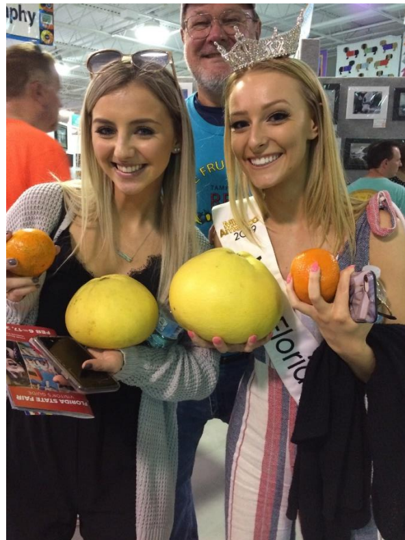
Miss Florida Citrus and select pummelos.