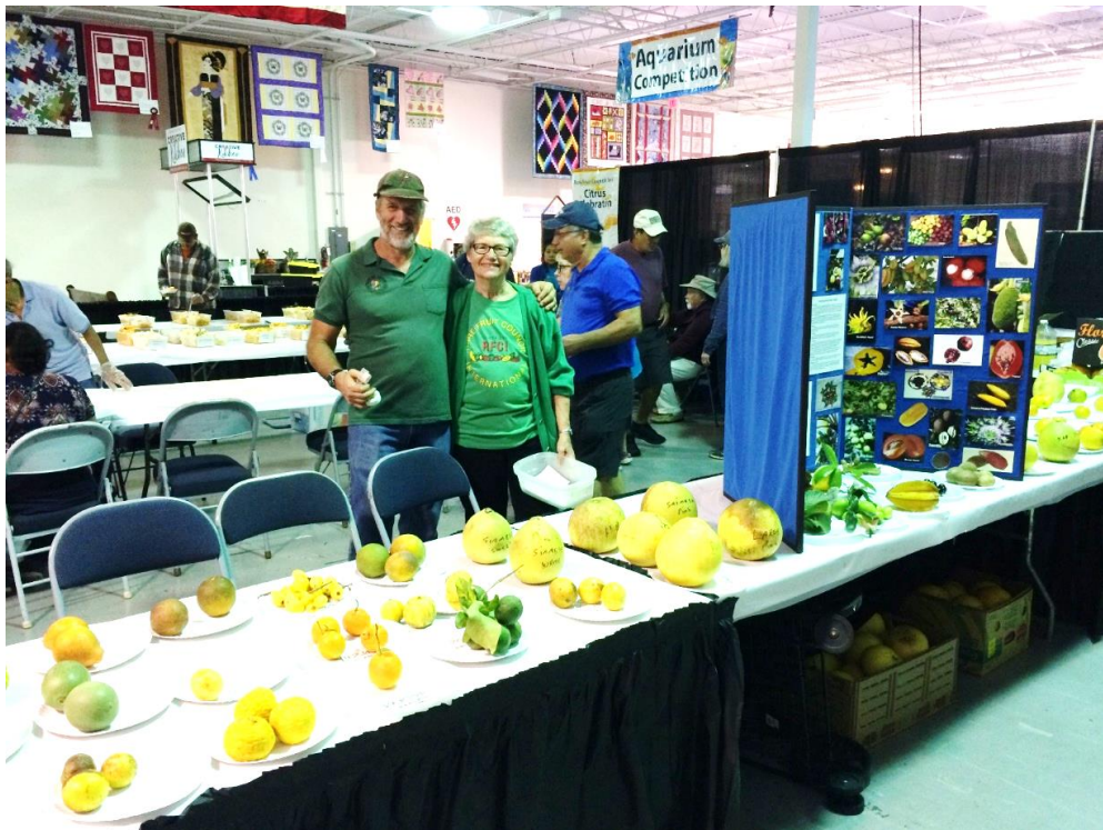
Beautiful fruit display.