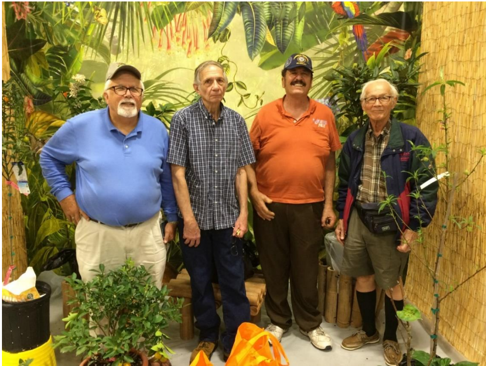
The setting up of the display.

All photos of the Citrus Celebration by George Campani