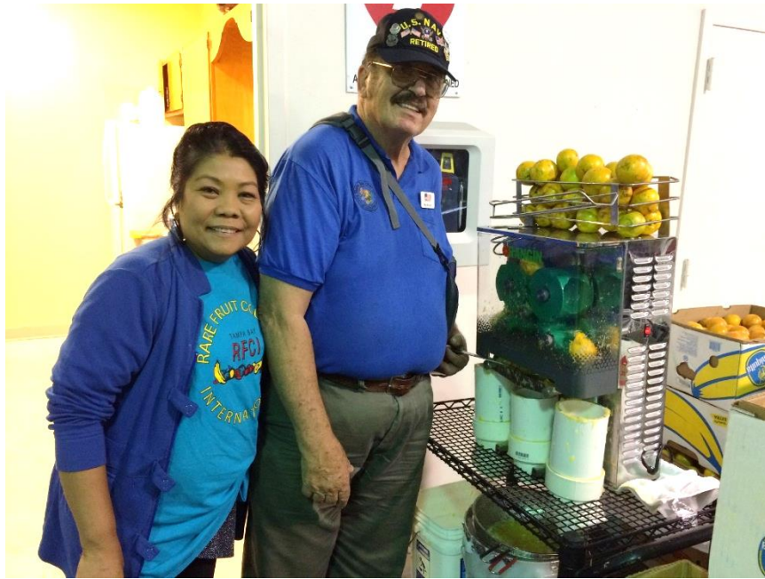
Squeezing the juice.