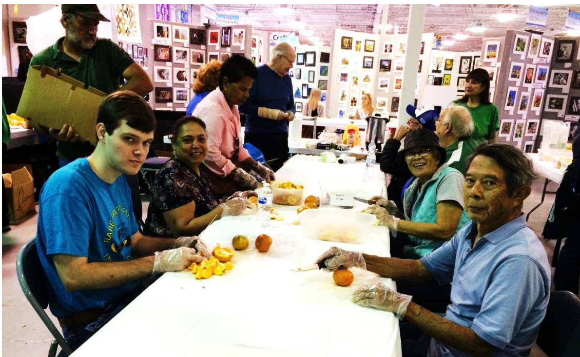
Oh, there's a lot of preparation of the fruit!