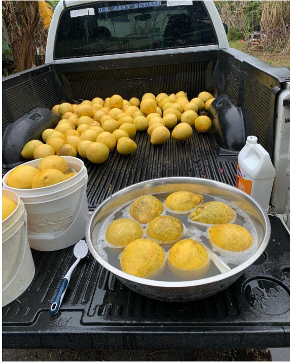
Time for scrubbing!