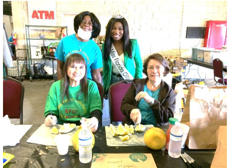
Preparing the juices, and cutting all the fruits for the Fair Goers.