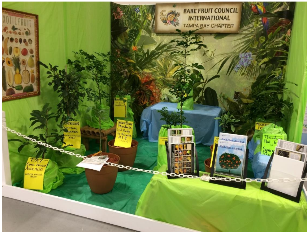
The finished display for the Club, ready for opening day.