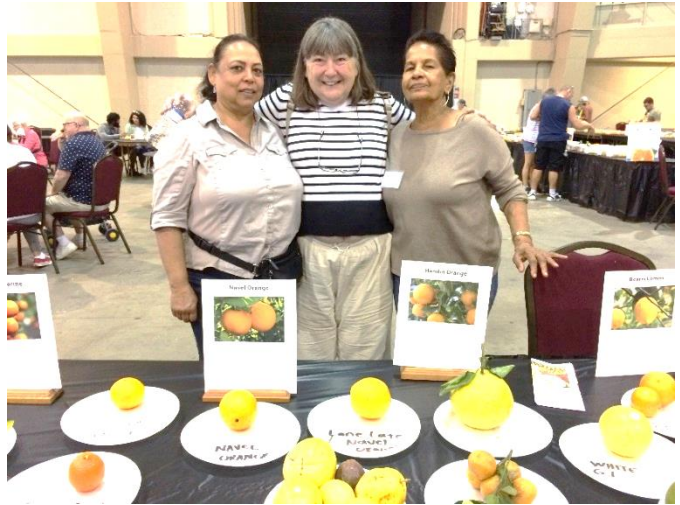
The wonderful display of fruits is ready for showtime.