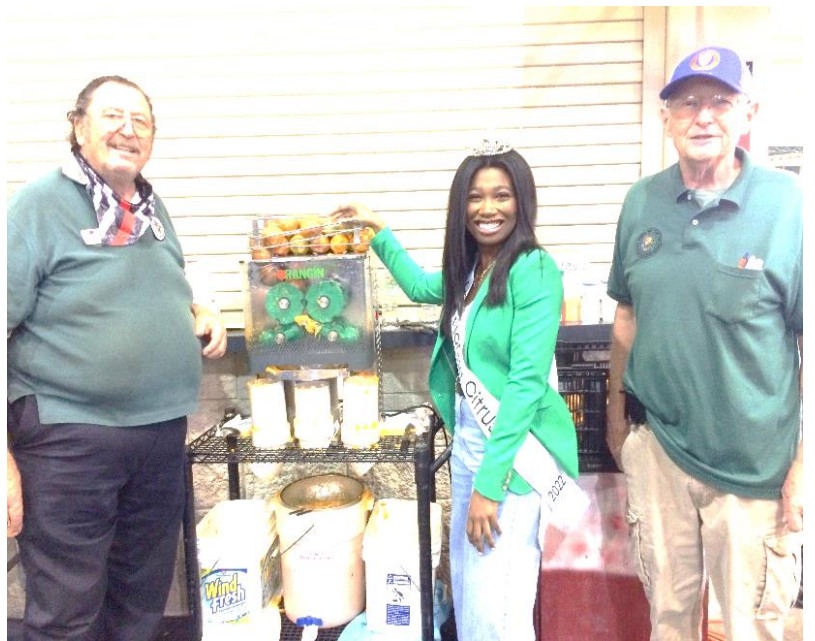
Making sure everything is ready to go for the throngs of citrus lovers.