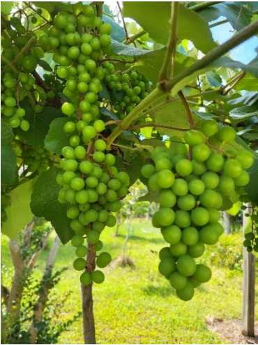
grape named FAMU 99

Job one now is to keep plants watered – potted, and in the ground. This time of year is our dry season, but this year finds us in an extreme drought.