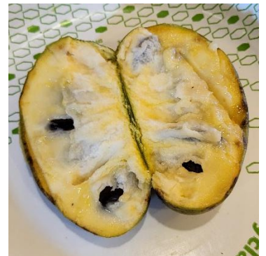
Asimina triloba , the Northern pawpaw - Paul Zmoda

We hope all of you got through the storm in good shape.